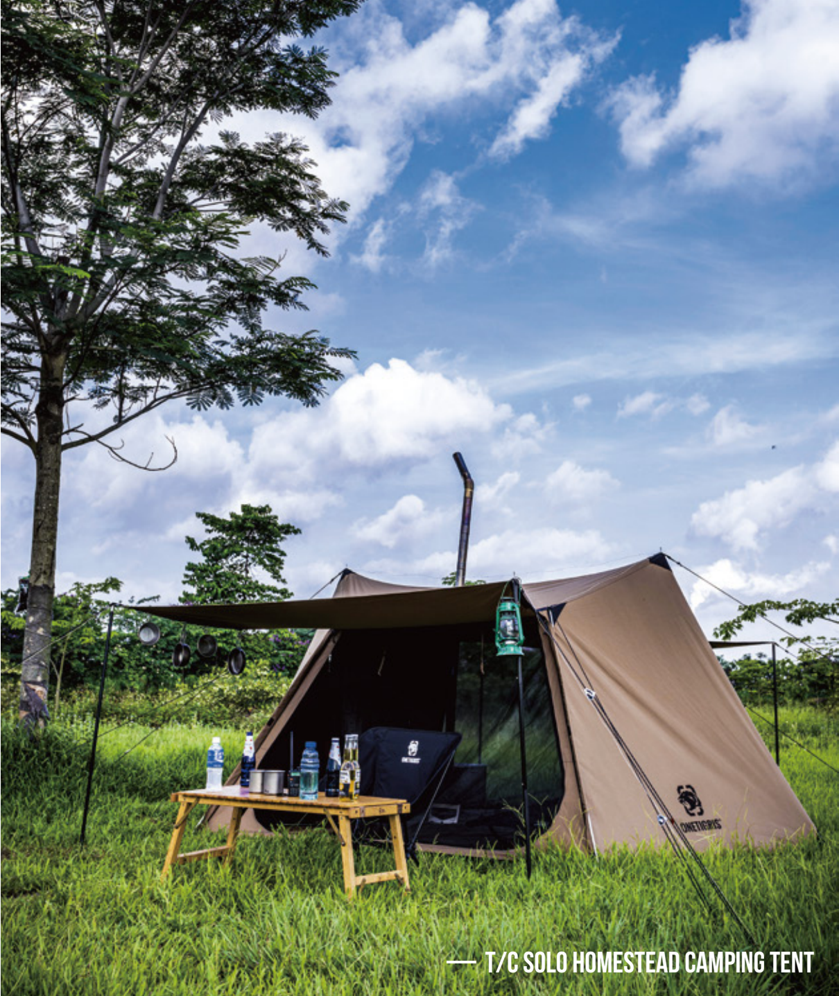
— T/C SOLO HOMESTEAD CAMPING TENT