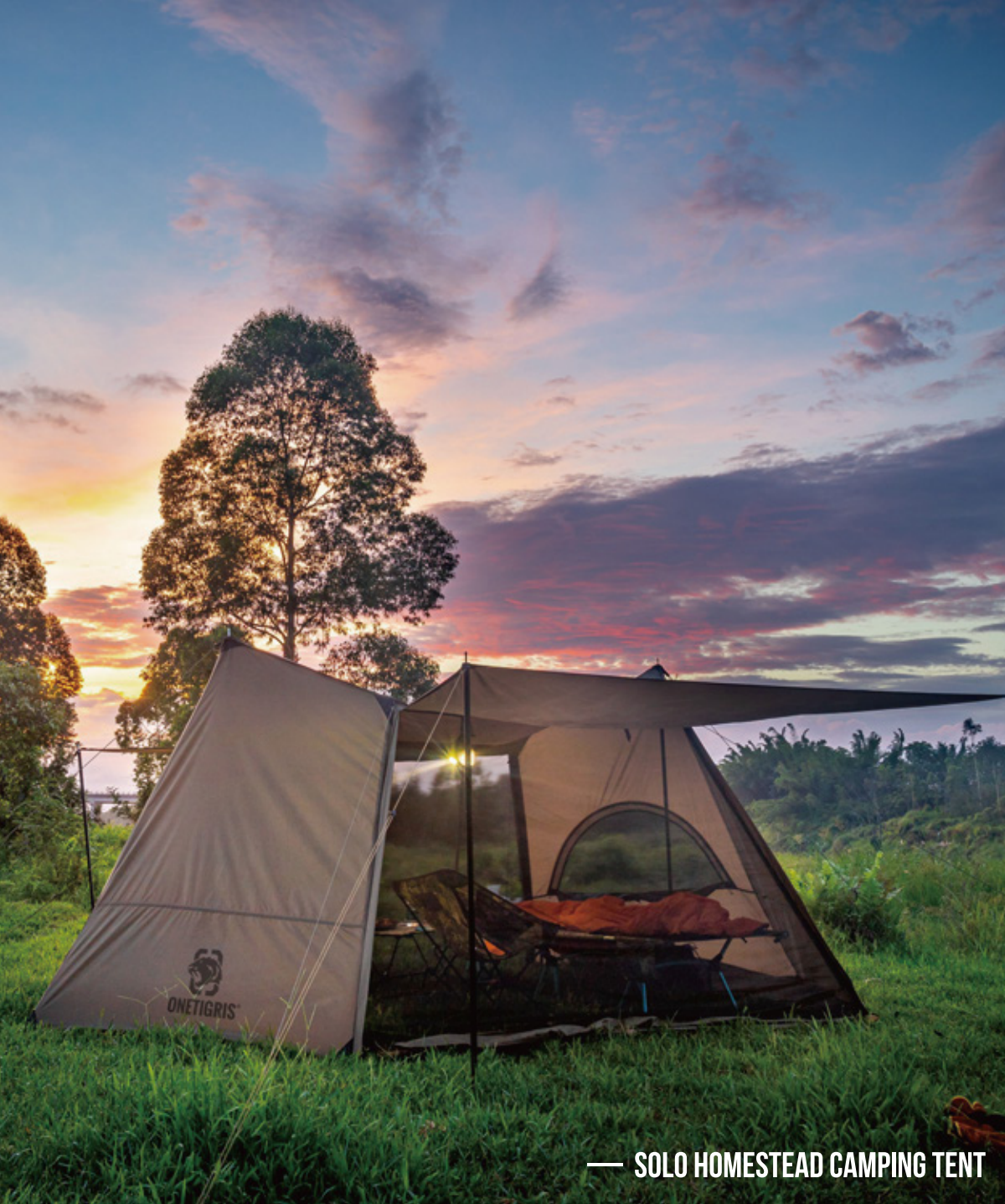
— SOLO HOMESTEAD CAMPING TENT