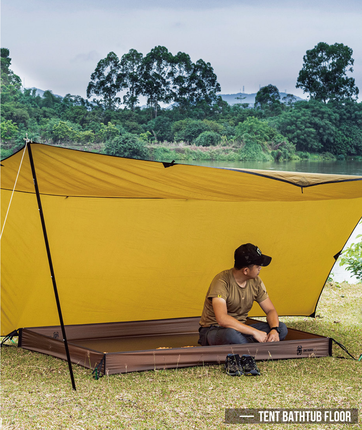
— TENT BATHTUB FLOOR