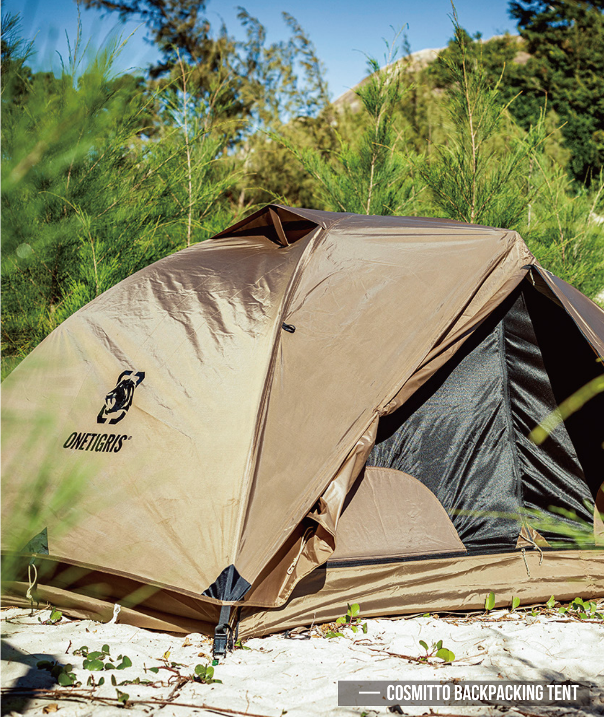
— COSMITTO BACKPACKING TENT