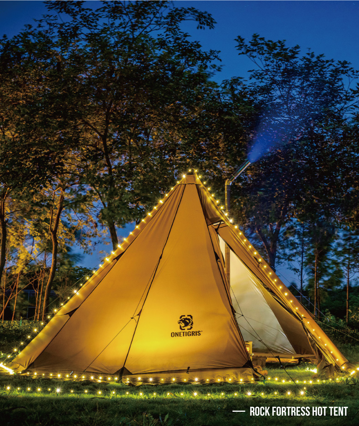
— ROCK FORTRESS HOT TENT