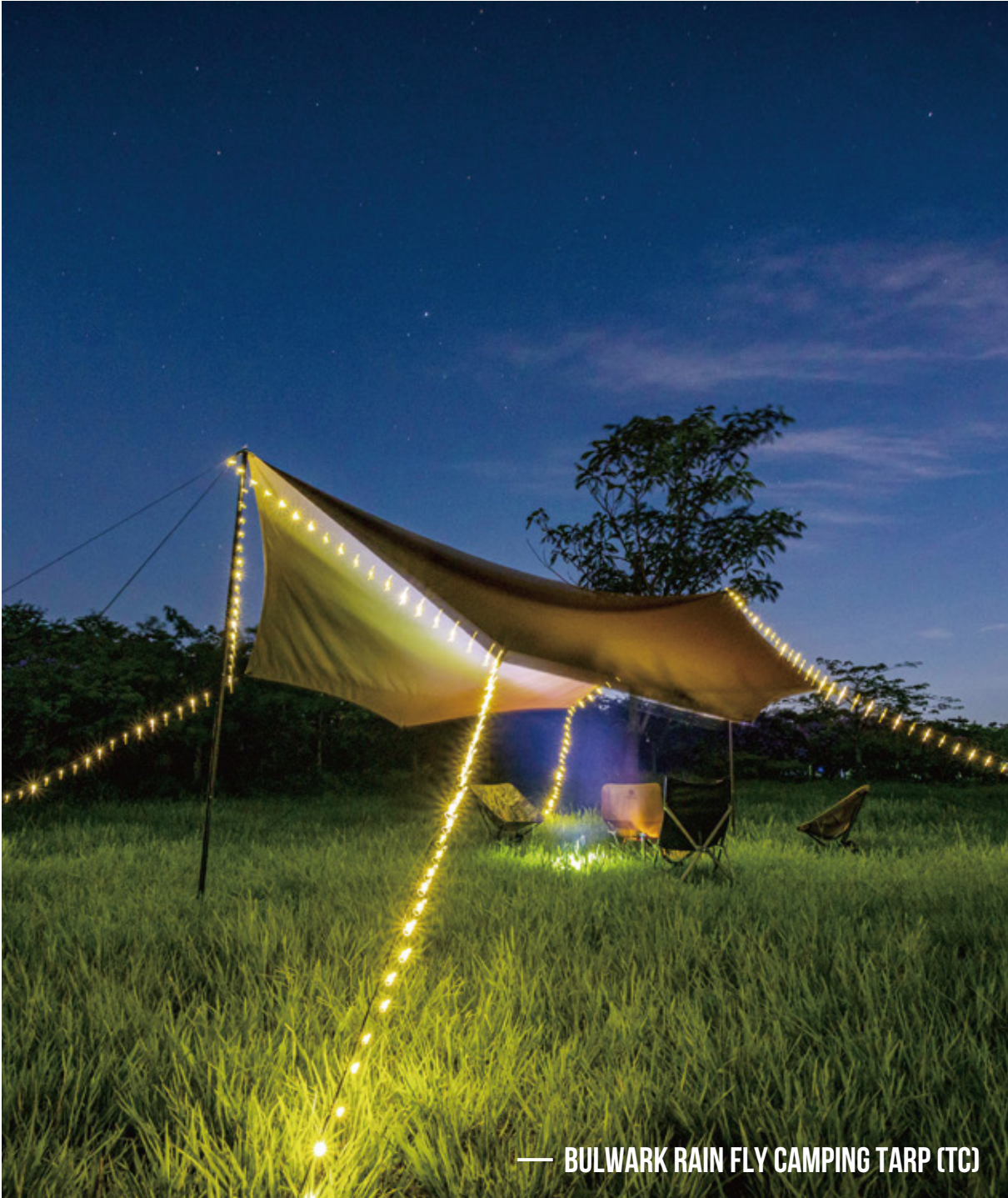
— BULWARK RAIN FLY CAMPING TARP (TC)