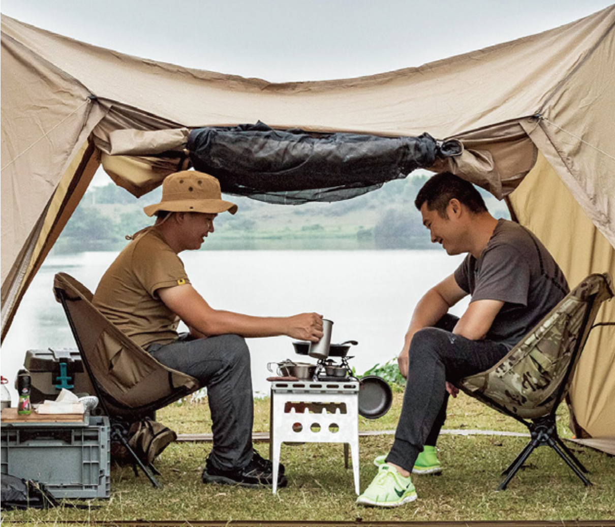
— PORTABLE CAMPING TABLE 02